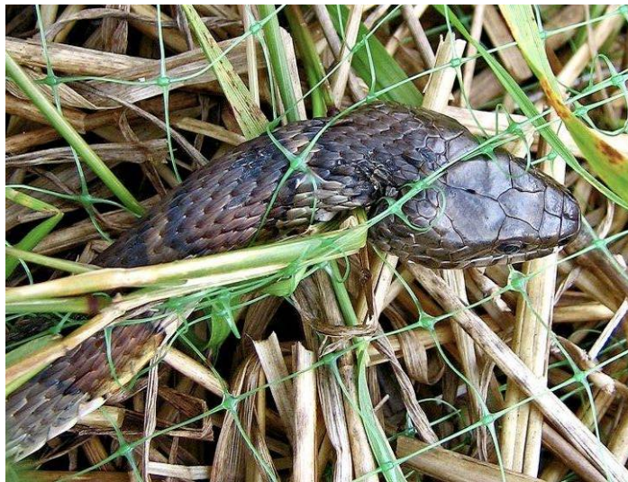
Snake entangled in an erosion control blanket's plastic netting. (Photo by Mark Backus).

A variety of manufactured products may be used during construction projects to temporarily protect soil from erosion and facilitate establishment of vegetation (“erosion control”), or to trap eroded sediment and retain it onsite (“sediment control”). Several of these products commonly contain plastic netting or mesh, which functions to: 1) stabilize soil or mulch; 2) bind loose fiber materials into a blanket or roll; or 3) reinforce geotextile fabric. Examples of temporary erosion and sediment control products that may contain plastic netting include mulch control netting, erosion control blankets, fiber rolls (wattles), and reinforced silt fences.