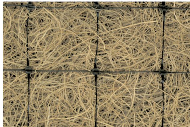
Close-up of extruded plastic netting

These blankets can be composed of all natural-fiber materials, all synthetic materials, or a combination of both. A natural-fiber matrix (such as straw or coir) bound with plastic netting is a very widely-used type of erosion control blanket. The netting is often stitched to the matrix, either with a synthetic thread (such as polypropylene) or a natural-fiber thread (such as cotton). To be considered 100% biodegradable (which is the environmentally preferable option), all components of an erosion control blanket (including netting and thread) must be made of natural-fiber materials, not just the matrix fibers. If a blanket with a straw matrix is used, certified weed-free straw should be used to avoid contributing to the spread of invasive weeds.