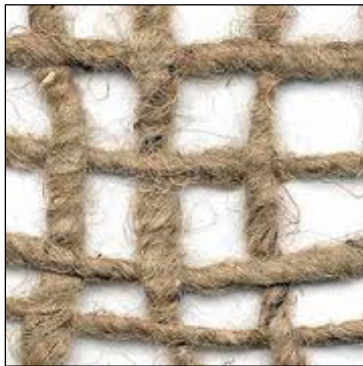
Close-up of jute mulch control netting

Although jute is a natural plant fiber, be aware that some manufacturers use the term “jute” in labeling a variety of synthetic netting products (such as polypropylene “Poly Jute”) that mimic the look of natural fibers, but are actually made of plastic.