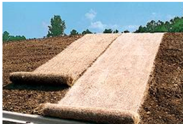
Temporary Rolled Erosion Control Product (RECP)

Temporary Rolled Erosion Control Products (RECPs) are flexible nets, blankets, or mats that are unrolled to cover exposed soil surfaces, typically on slopes. Most temporary RECPs contain netting, either by itself, or binding loose fiber materials to form a blanket or mat. These products are used to reduce erosion from rainfall and wind, hold moisture near the soil surface to promote seed germination, and stabilize soils until vegetation is established. Temporary RECPs are usually used with seeding, but may also be used on exposed soils when seeding would not be successful (such as late in the season).