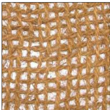
Coir mulch control netting

Netting by Itself: RECPs composed entirely of netting go by many names, including mulch control netting, erosion control netting, soil netting, erosion control mat, jute mesh or netting, and coir mesh or netting. Because these products are woven with open spaces (apertures) in the netting, they are also classified as open-weave textiles. Mulch control netting is a woven natural-fiber or synthetic plastic mesh used to stabilize a loose mulch layer (such as straw or wood fiber), usually after seeding. Some erosion-control netting products have a more tightly-woven construction, which enables them to provide erosion control without the use of an underlying loose mulch layer. Synthetic netting is commonly made of polypropylene or polyester; natural-fiber netting choices include coir or jute.