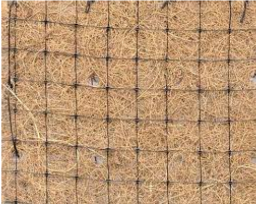
Coir erosion control blanket with plastic netting

Erosion control blankets are available with netting on one or both sides, and there are also net-less blankets (for example, composed of excelsior). The netting may be made of either natural-fibers (usually coir or jute) or synthetic plastic (usually polypropylene or nylon). The plastic netting is much cheaper than the natural-fiber netting. This netting comes in a variety of mesh sizes; ½-inch and 1-inch openings are common sizes.